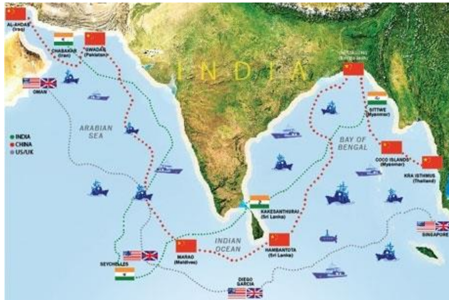
Maritime borders of India