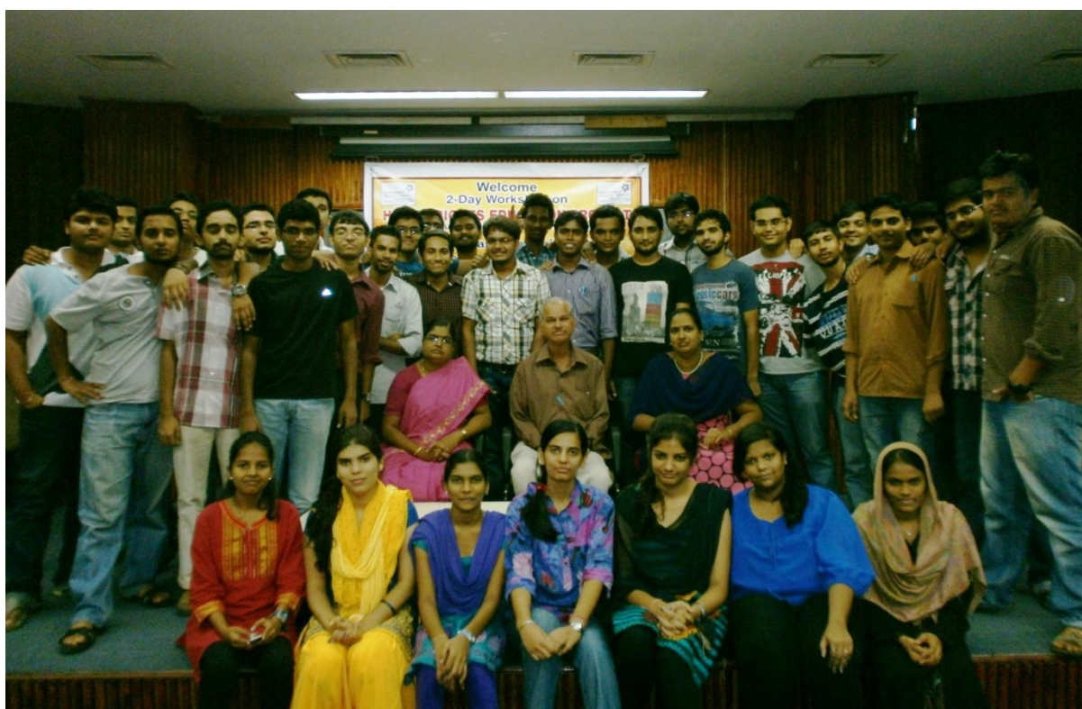
PARTICIPANTS with Facilitator, Guests and College Officials